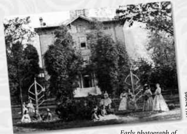
Early photograph of Sayre School

The slightly smaller house located next door at 158 Constitution St. was built in a purely Italianate style with more ornate features evidenced in the uniquely constructed front entryway featuring ornamental brackets and wood corbeling.