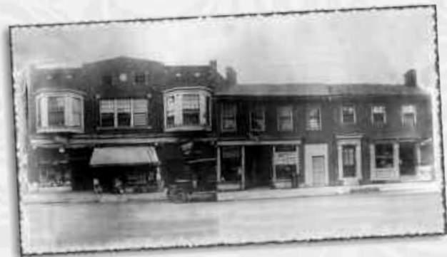
Early photograph of part of North Limestone St.