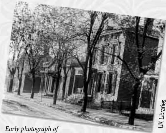
Early photograph of Constitution Street