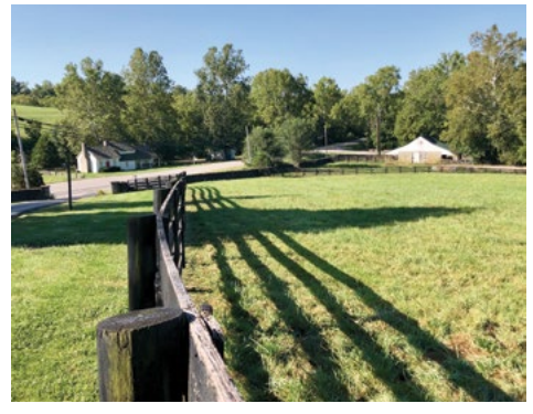
Forest Retreat tavern and barn

The house complex alone is an exceptional testimony to wealth and (high) style in the early Euro-American Bluegrass. But it also is our favorite plague property this issue for its assemblage of material artefacts that more broadly remind us of Kentucky land and life in the early republic. Down the hill from the main house is a dry-laid stone pillar barn reportedly built by enslaved craftsmen. By 1840 the census reported thirteen enslaved people in a household totaling twenty, who together were responsible for running the approximately 1500-acre farm. Across the road from the barn is "Peyton's Tavern," built around the same time as Forest Retreat as a traveler's waystation on the Maysville Turnpike, replete with a classic external staircase to keep strangers apart from the innkeeper's domicile. Governor Metcalfe late in his life was a