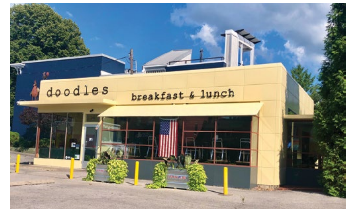
Doodles Breakfast & Lunch café at 262 North Limestone was built as a Shell gas station after WWII. The exterior was clad in Shell's yellow porcelain tiles with red accents. In the early 1970's, the building was bought by Doodles Welch who converted it into a liquor store with a drive-up window. The gas pumps out front were removed. Tim Mellon eventually acquired and renovated the building, painting exterior tiles that were chipped and cracked the original shade of butter yellow. The men's and women's restrooms have the original floor tiles. Doodles café, opened in 2008, is in the Constitution Historic District.

Old gas station buildings still exist, but for various reasons generally aren't used for pumping gas. Many have been creatively adapted to other uses such as restaurants, bars. cafes, barber shops, clothing stores and office space for small businesses. (See photos for examples.) 🛞