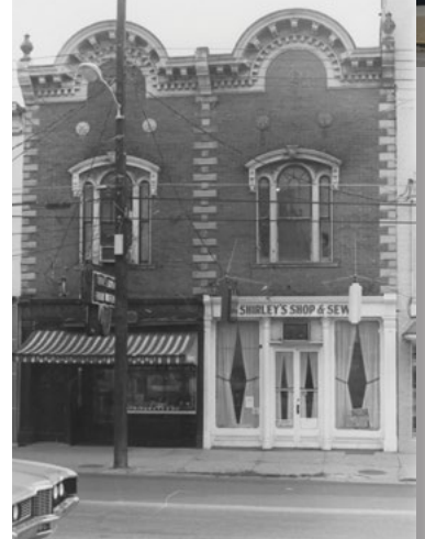
18 West Main Street today