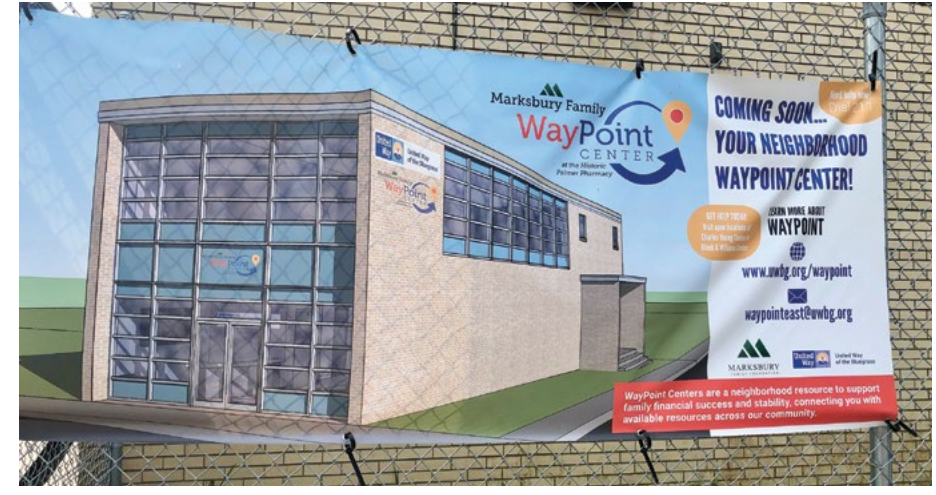
Architectural rendering of renovated Palmer Pharmacy, scheduled to become the Marksbury Family Foundation WayPoint Center to bring customized programs to help individuals and families achieve financial stability and good physical and mental health.

The United Way of the Bluegrass operates four WayPoint Centers: at the Black & Williams Neighborhood Center; one in Paris; another in Cardinal Valley; and lastly one at the Charles Young Center, which will move to Palmer Pharmacy and become the flagship program.