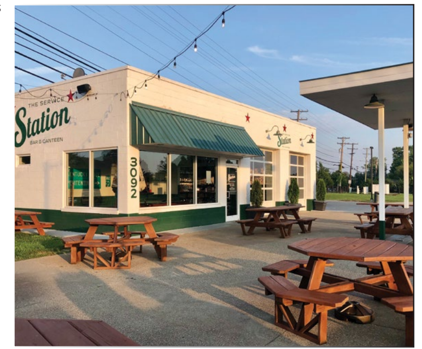
The Service Station bar was constructed in 1952 as a Texaco service station. It was a traditional American gas station design with two service bays where cars were washed and lubricated, and an office/waiting area. Texaco's motto was "You can trust your car to the man who wears the star." The company logo was a bright red star with a green T in the center and was used on Texaco signs and station attendants' caps. Red stars were mounted around the top of Texas service stations, and these are still in place on the Service Station bar at 3092 Leestown Road.

The typical gas station design was an oblong box with two drive-in bays accessed by large,