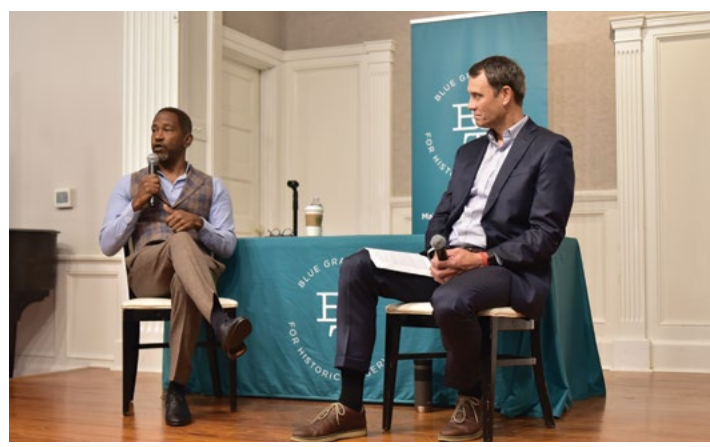
The morning after the lecture, the Blue Grass Trust hosted its inaugural Hopemont Lecture Preservation Workshop. Over fifty preservation professionals, grassroots leaders, and students met to further discuss the possibilities and challenges of saving historically Black spaces and how the work to preserve African American stories already has a long history in Central Kentucky.