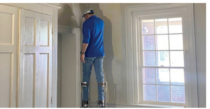
Damaged plaster is being repaired at Hopemont.