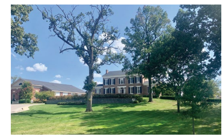
Mustard Seed Hill post renovations