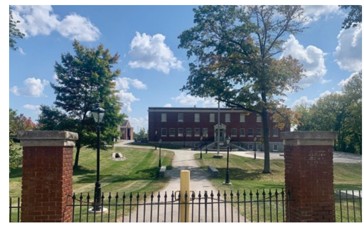
McIntyre Hall as it is today.