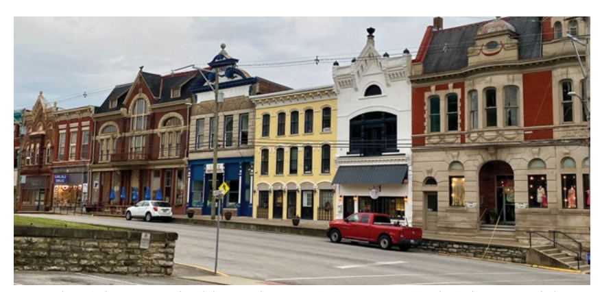
The 19th century buildings along Main Street retain their beauty while housing businesses that keep the downtown alive and an important part of life in Carlisle.