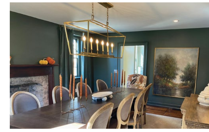
The dining room after renovation

A sizable rear addition provides a kitchen, master bedroom and bath, and a laundry room. A hallway with a 10-foot ceiling between the old and new marks the separation and offers a great opportunity to showcase the exterior brick wall, creating a "bridge" between the two sections. The modern kitchen has touches of the old house — flooring, exposed ceiling beams, trim, and shelves all made from wood from the old dairy barn on the property.