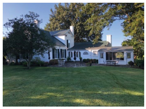
View of the rear of Forest Retreat