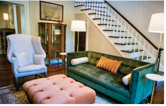
The west parlor after renovation

by vermin as well as the unsanctioned visitations of high schoolers looking for a place to have late-night weekend gatherings. Fortunately, there was no structural damage, and the tin roof kept the house dry for the last three and a half decades, but the clean-up was an enormous task taking several months.