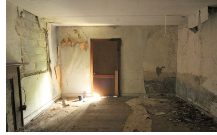
The dining room before renovation

An intriguing aspect of the house is its two front doors. Why two doors? The