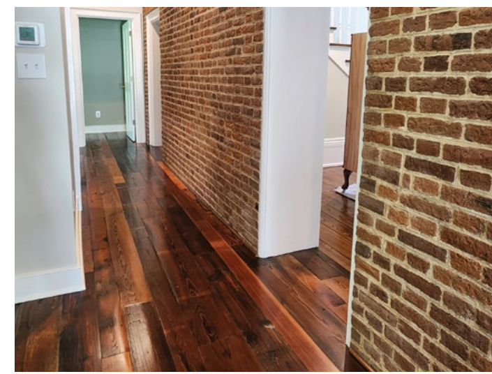
This hallway is a "bridge" separating the original structure from the contemporary addition.

most likely explanation is one door, the one to the left (west) was for family and daily use. That door led to a comfortable room connected to the dining room and has stairs to the second-floor rooms, while the front door to the right (east) is thought to have been a room for entertaining guests. When Karyn lived on the farm, an Italianate addition was made to the front doors, creating a single-entrance foyer, while the two six-panel wooden doors remained in the entryway. Those doors have now been replaced with glass panel doors, and the original wooden doors have been relocated upstairs.