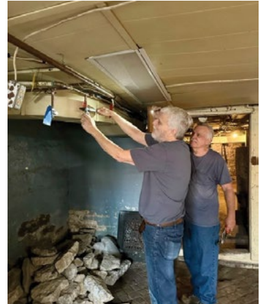
L-R: An upgrade of the entire electrical system of Hopemont is underway. Plumbers are refurbishing the lines at Hopemont, including adding more emergency cut-off valves.