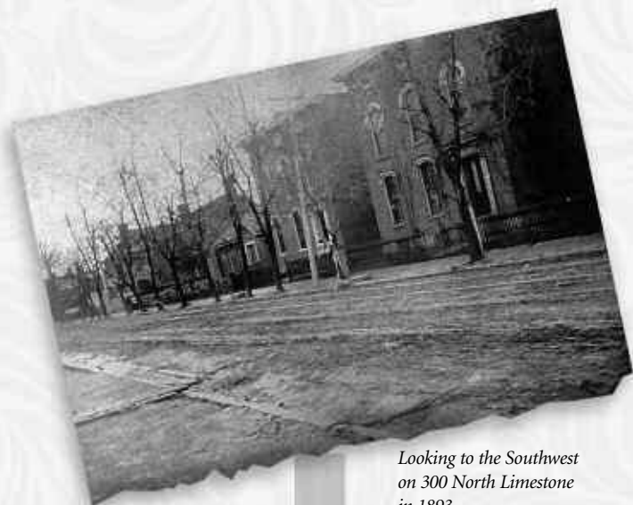
Looking to the Southwest on 300 North Limestone in 1893.