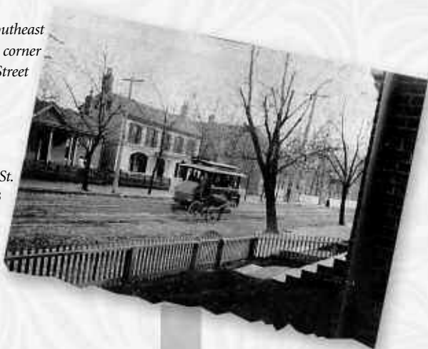
Looking Southeast toward the corner of Fourth Street and North Limestone, looking at 404 North Limestone St. taken 1893