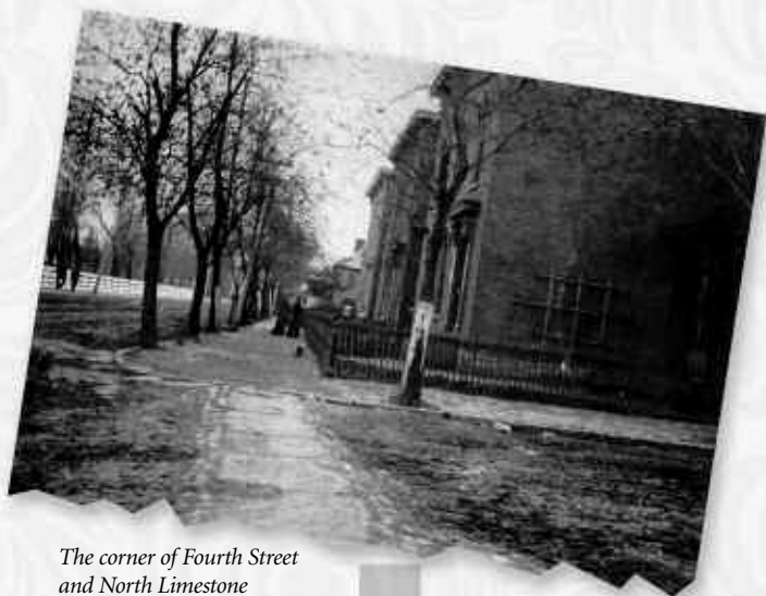
The corner of Fourth Street and North Limestone looking South taken in 1893.