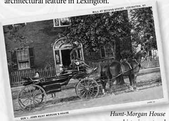
Hunt-Morgan House historic postcard

Features of this Federal style house include the elegant fanlight above the front door, a Palladian window, and an arched window in the pediment. Commonly found in the Deep South, the porch along the south wall of the structure is the only example of this architectural feature in Lexington.