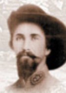
GEN. JOHN HUNT MORGAN THE "THUNDERBOLT OF THE CONFEDERACY"