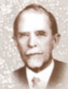
DR. THOMAS HUNT MORGAN NOBEL PRIZE WINNING "FATHER OF MODERN GENETICS"