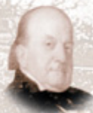
JOHN WESLEY HUNT KENTUCKY'S FIRST MILLIONAIRE